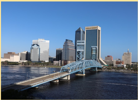
Sky Line-Jacksonville, Florida